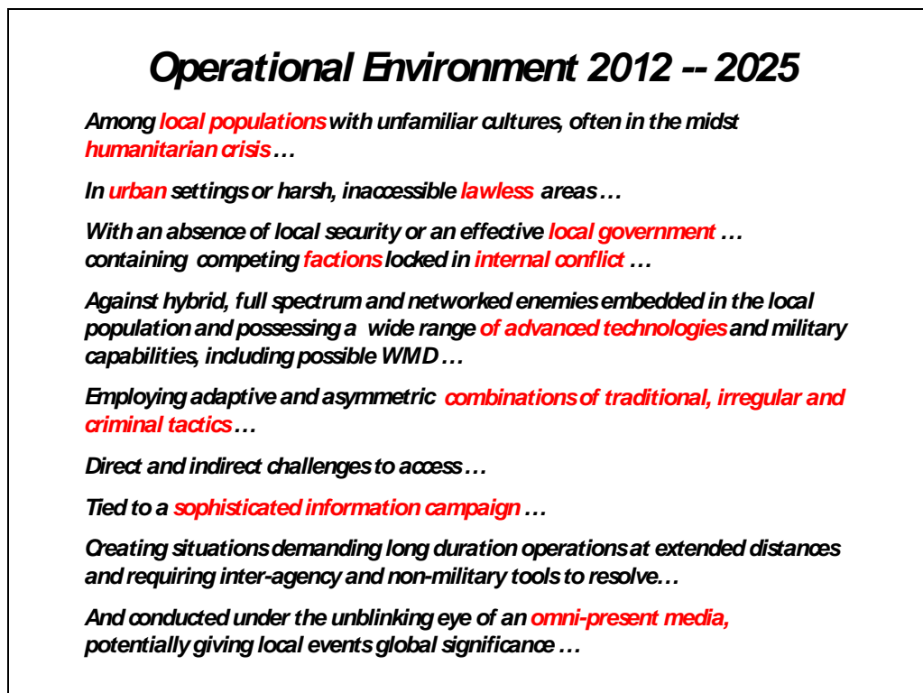
Figure M-1. The OE 2012-2025

b. In this context, the character of the various threats is constantly evolving, setting the stage for the emergence of the operational paradigm as illustrated in figure M-1. This paradigm will consist of conditions of complexity, volatility, uncertainty, instability, and ambiguity with and among other cultures. This paradigm also suggests America's foes will operate in complex terrain and urban environments to lessen U.S. standoff and long-range precision fires; they realize the majority of the world's population is increasingly concentrated in urban areas of political, economic, and social power. In addition, U.S. adversaries will attempt to deny or limit regional access, attack U.S. information systems, and dictate the tempo of the changing environment.