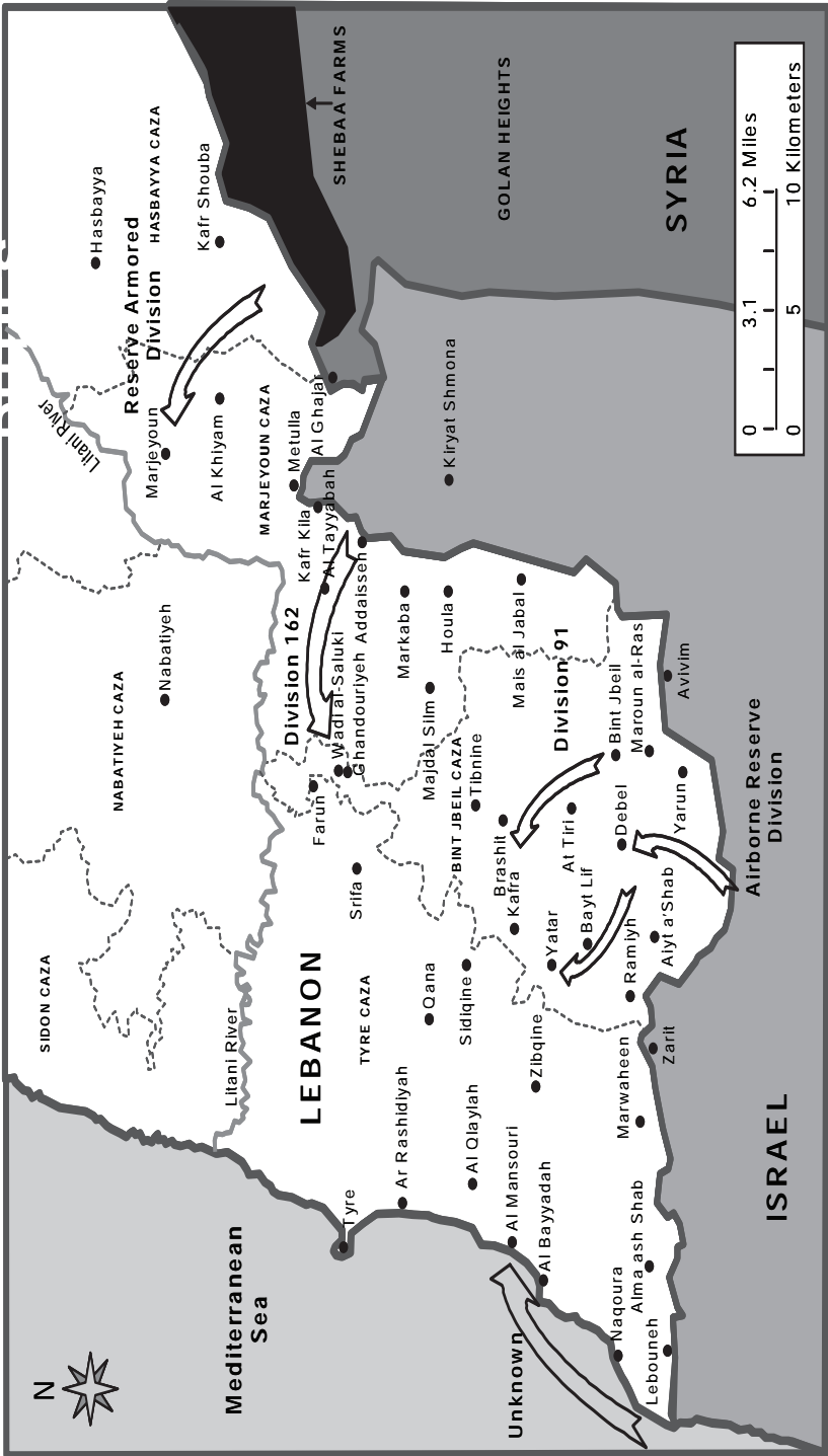
Map 4. Drive to the Litani