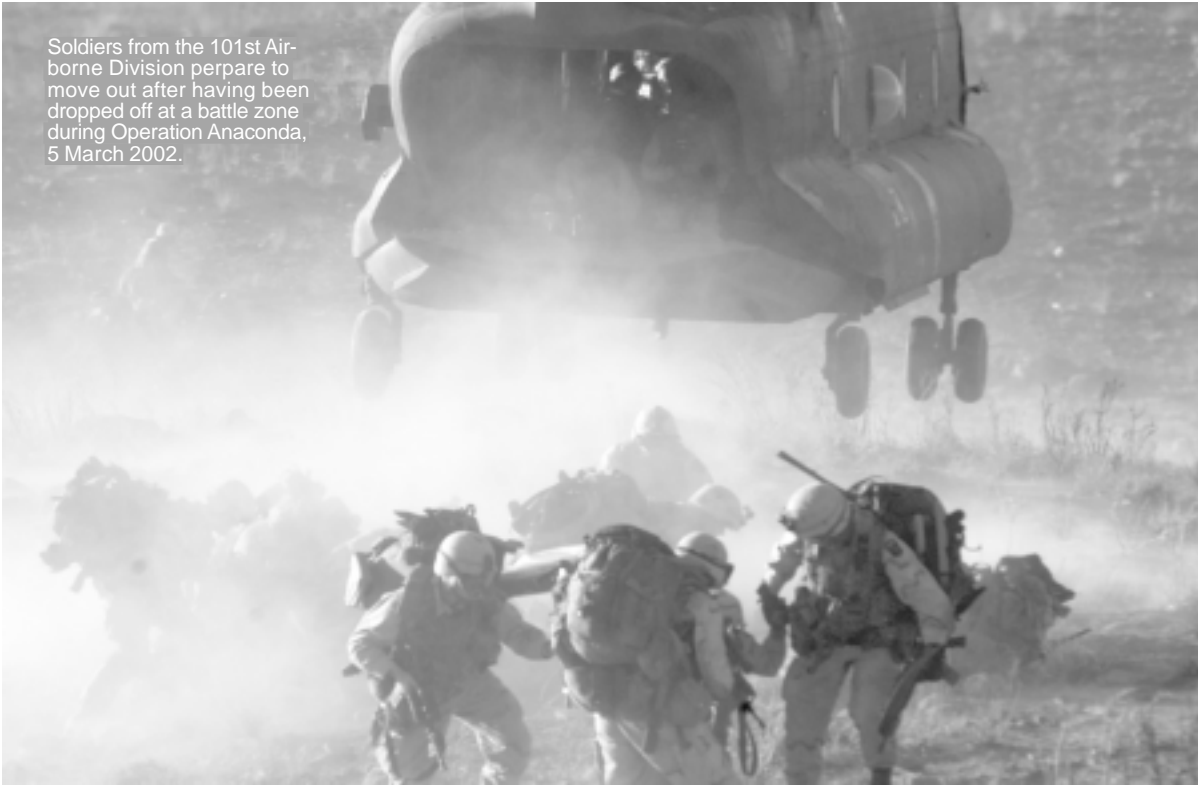
Soldiers from the 101st Airborne Division prepare to move out after having been dropped off at a battle zone during Operation Anaconda, 5 March 2002.