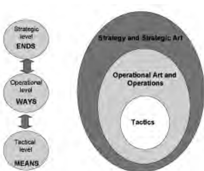
Figure 1. Two Contending Views of the Ends-Ways-Means Relationship.

assembly line with Frederick Taylor measuring progress. It demeans the importance of the continuous and intimate two-way conversation that is essential for success. A more satisfactory perspective would notice that these are nested. These two contending views are shown diagrammatically at Figure 1. In practice – but not in our current theory – tactics and operational art are a part of – and not subordinate to – strategy.