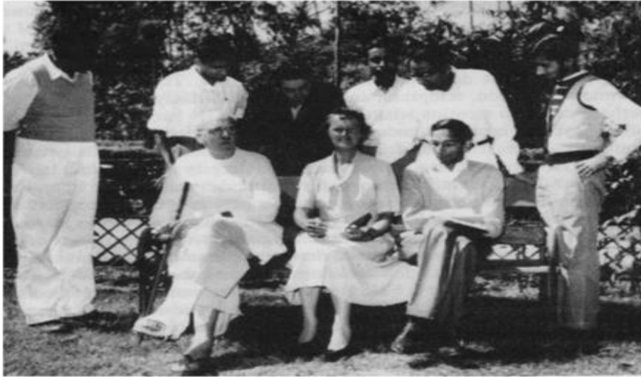
(J. B. S. Haldane surrounded by his associates, on the campus of the Indian Statistical Institute, Calcutta, 1961)

World." Jerzy Neyman objected that "India has its fair share of scoundrels and a tremendous amount of poor unthinking and disgustingly subservient individuals who are not attractive." Haldane retorted: