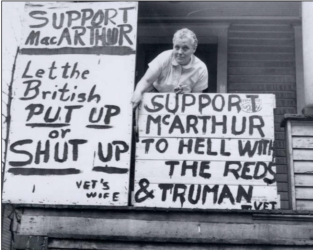
Protest of General MacArthur's Dismissal (, Youngstown Ohio, 13 Apr 51)