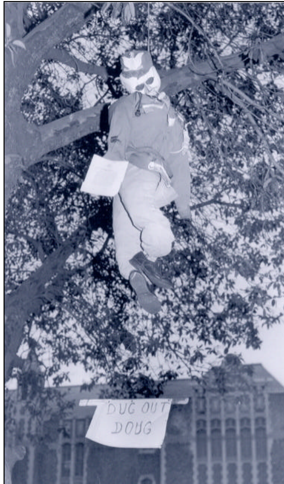
The General Hangs at Dawn (, Seattle, Washington, 13 Apr 51)

Truman announced the discharge of MacArthur, he told his White House staff that the general, like George B. McClellan in the 1860s, “worked with the minority to undercut the administration when there was a war on.” The next day, the New York Herald Tribune summarized the progression of events quite perceptively: “The most obvious fact about the dismissal of General MacArthur is that he virtually forced his own removal.” 30