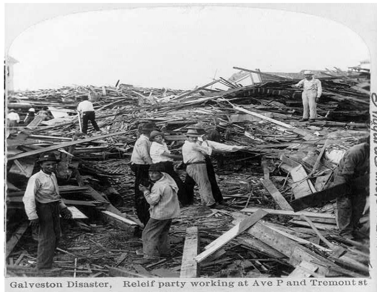
Figure 1. Picture of Galveston, Texas

On September 8, 1900, the deadliest hurricane on record devastated the city of Galveston, Texas. Claiming between 8,000 and 12,000 lives, destroying roads, railways, and telegraphs, the hurricane left the survivors stranded until outside help could reach the city of rubble. Galveston lay below sea level and a large storm surge churned the city into a pile of broken lumber. Survivors struggled to remove the remnants of their lives from the devastation and piece them back together into a community. 1 In the picture below, the catastrophic results of the hurricane are evident.