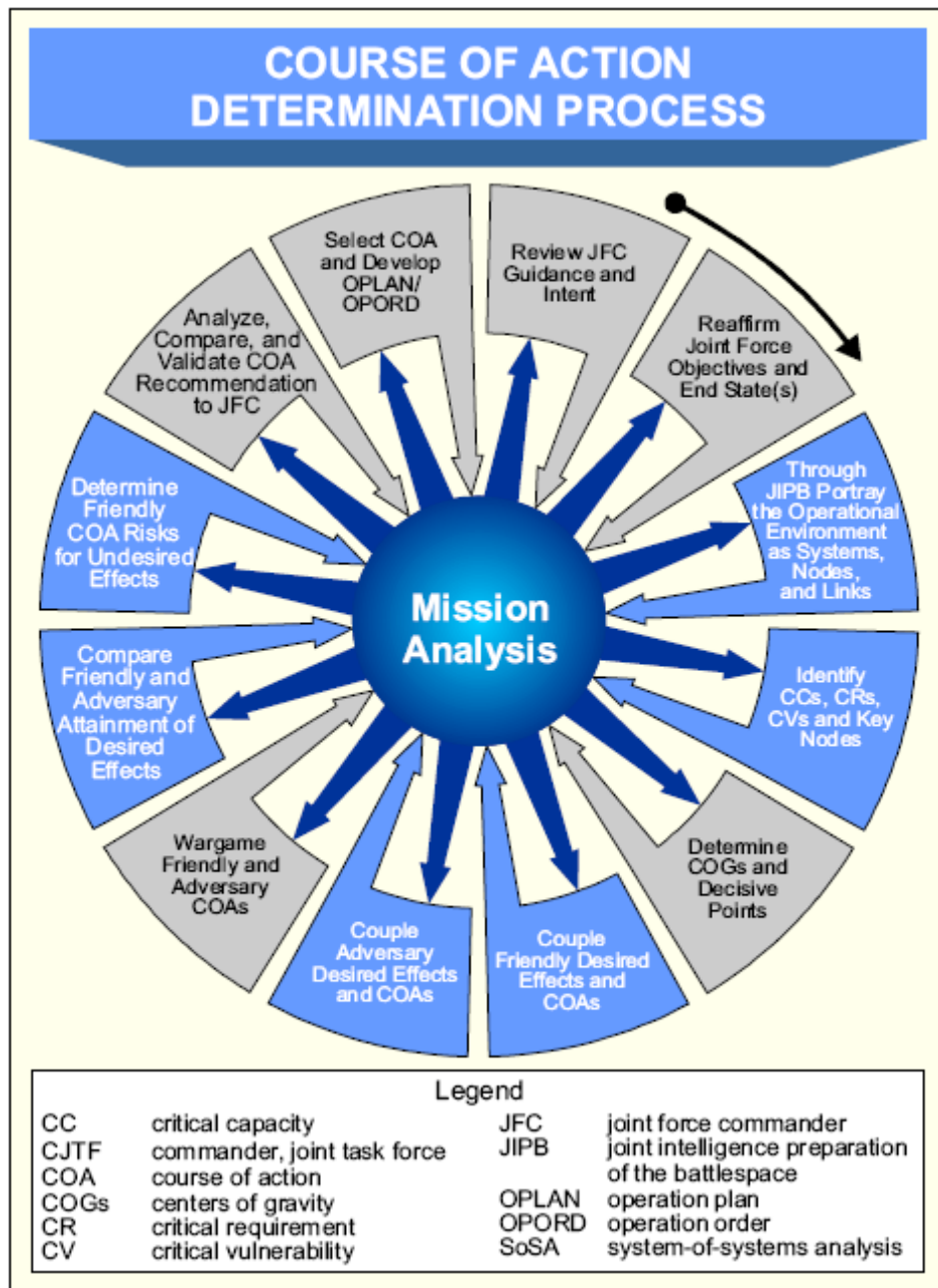
Figure 2. Course of Action Determination Process 24

Once the development of potential COAs is completed, each one is vetted through the analysis, comparison, and selection phase of the determination process. The result is a workable list of COAs that are then translated into a plan or order in preparation for