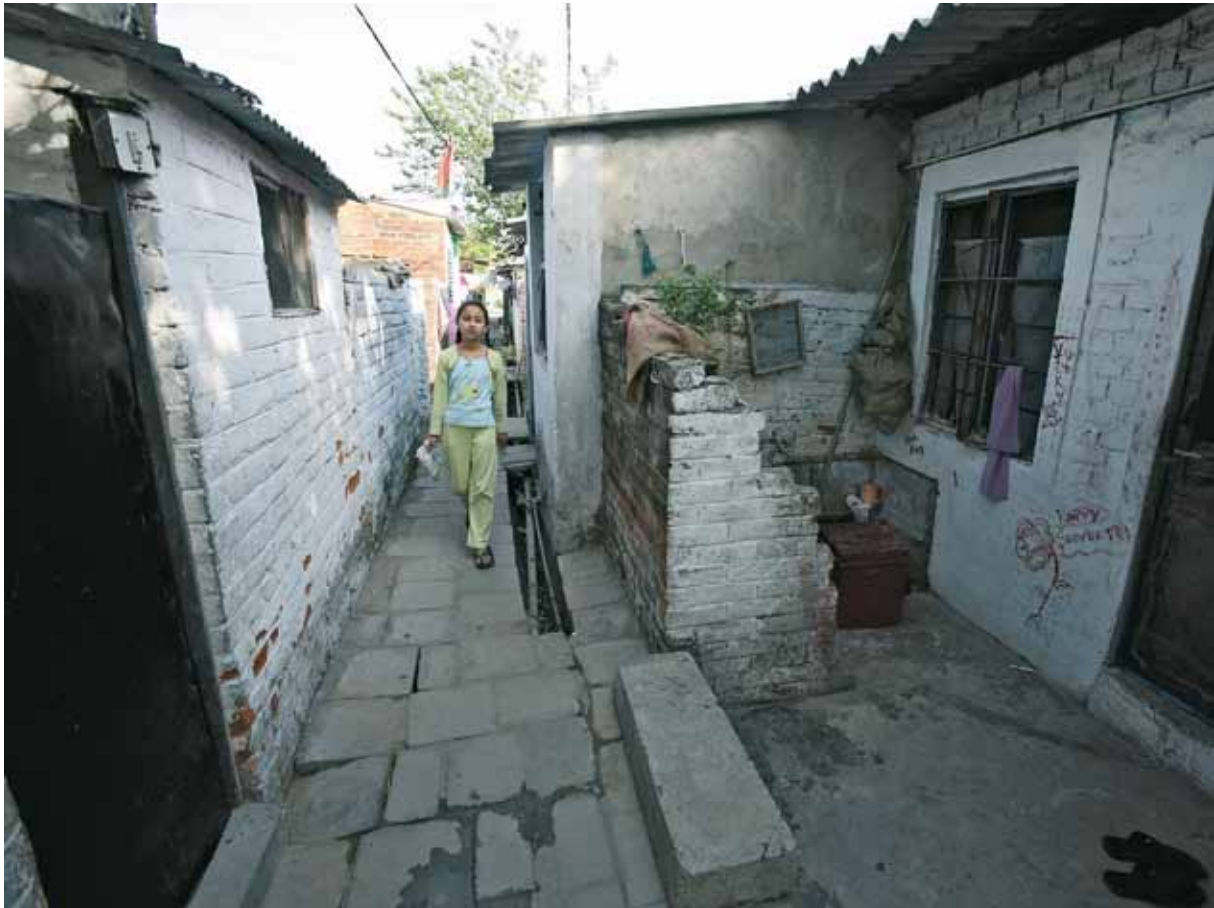
A Kashmiri Pandit girl walks inside the Muthi migrant camp on the outskirts of Jammu.

the displaced community is related to the immense economic loss of immovable properties – houses, shops, agricultural land and orchards – that they left behind. They have lost revenue as they are unable to pursue their occupations and businesses. Along with this temporary loss, many of them have also suffered irreparable permanent loss, since their immovable property has been burnt or destroyed. The property of many others was allegedly usurped, either through the tampering of revenue and land records or through illegal encroachment. According to an estimate prepared by the Kashmiri Migrant Fruit Growers Association, about 9 600 Pandit orchardists owned 3 600 hectares of apple, walnut and almond orchards with a total worth of millions of