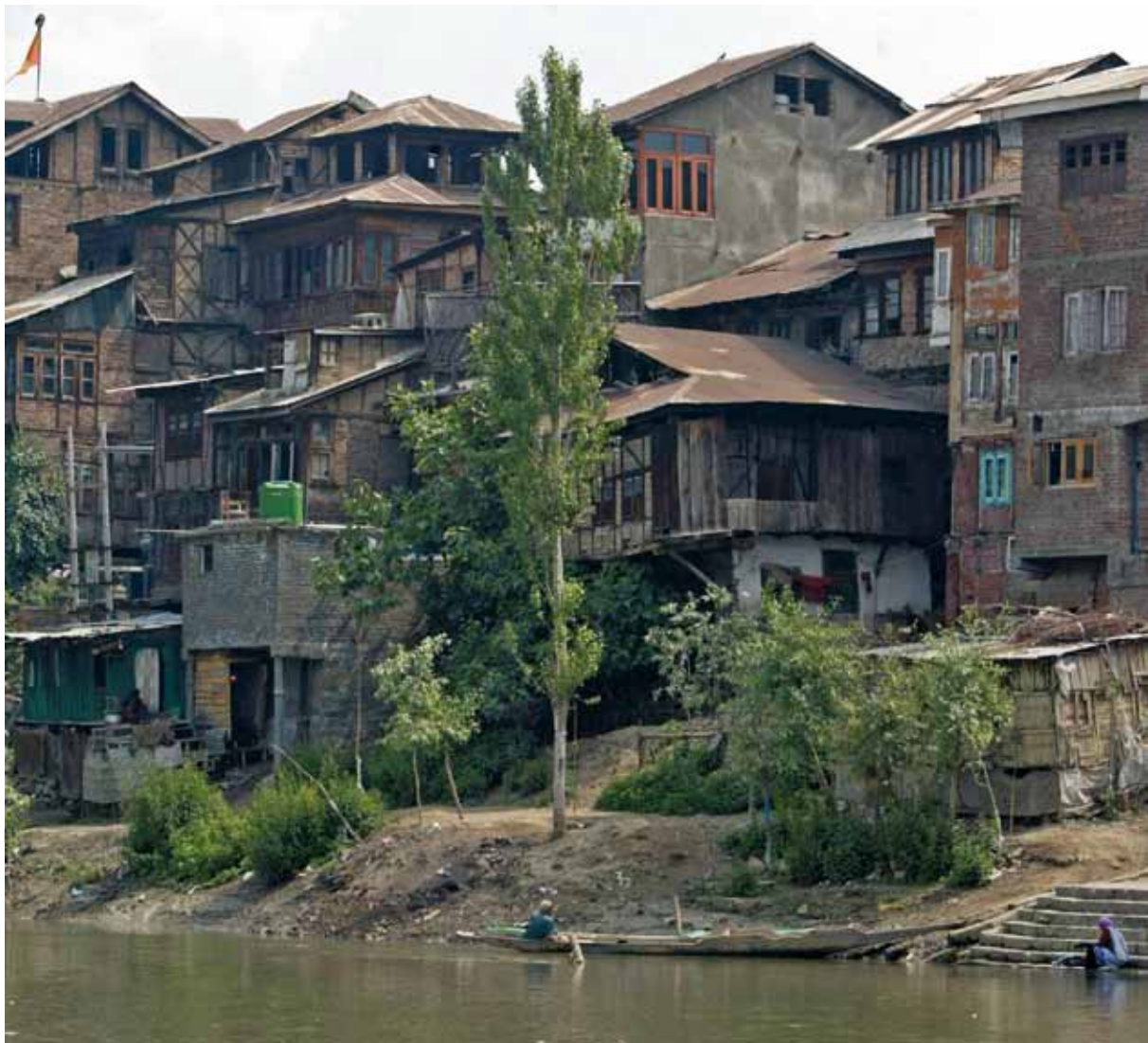
Some of the abandoned houses of Kashmiri Pandits on the banks of the Jehlum river in Srinagar. The Pandits fled the Himalayan region after a Muslim revolt broke out about 20 years ago.

concerned about their safety, and every killing of their close-knit community members started affecting their morale. 4 Fear was also fuelled by extremist propaganda, even from within the Pandit community. The Pandit elders fuelled panic about the fate that would befall the Kashmiri Pandit women if they did not leave. In addition, the administration failed to assure their safety.