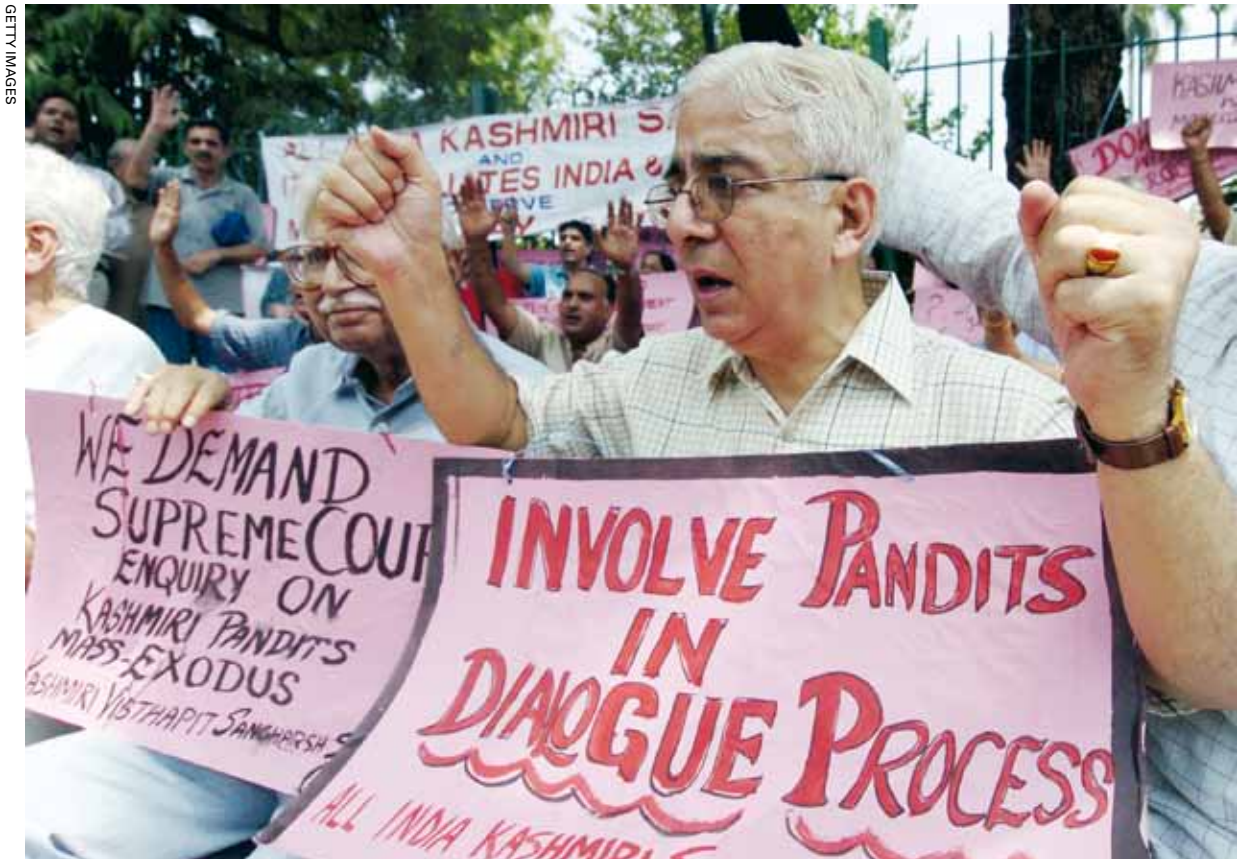
Kashmiri Pandits demonstrate against their forced displacement and request involvement in the peace process.

people died prematurely during the first 10 years of displacement. 9 The causes of death have been exposure to the hostile environment, snake bites, heat stroke, 10 heart problems and other ailments. The displaced people are experiencing a perceptible increase in both existent health problems as well as many new disorders, which were previously unknown or rare in the community. The problems that have become common among the camp dwellers are heat stroke, dengue fever, malaria, dysentery, jaundice, allergies, tuberculosis, bronchial asthma, pneumonia and skin diseases like scabies. Stress-related diabetes has also become rampant among displaced people of even a young age. This has not only adversely affected the productive years of their lives, but also has led to impotency in many cases. Psychological and metabolic stress, coupled with other factors, has also led to a sharp rise in deaths and a decline in the birth