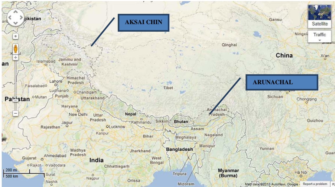
Figure 1. Major Disputed Areas of Aksai Chin and Arunachal Pradesh along Sino-Indian Border

Himalayan Ranges. The entire boundary between India and China has not been formally delineated, however in terms of potential conflict, the Eastern and Western Sectors figure most prominently.