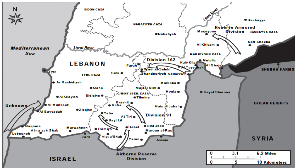
Figure 3. Final Offensive 110

spectacular ambush illustrated the lack of training the Israeli forces had in combined arms maneuver and executing simple defile drills.