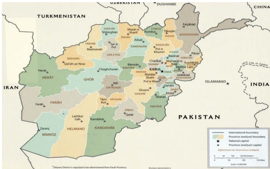
Figure 4. Afghanistan 114