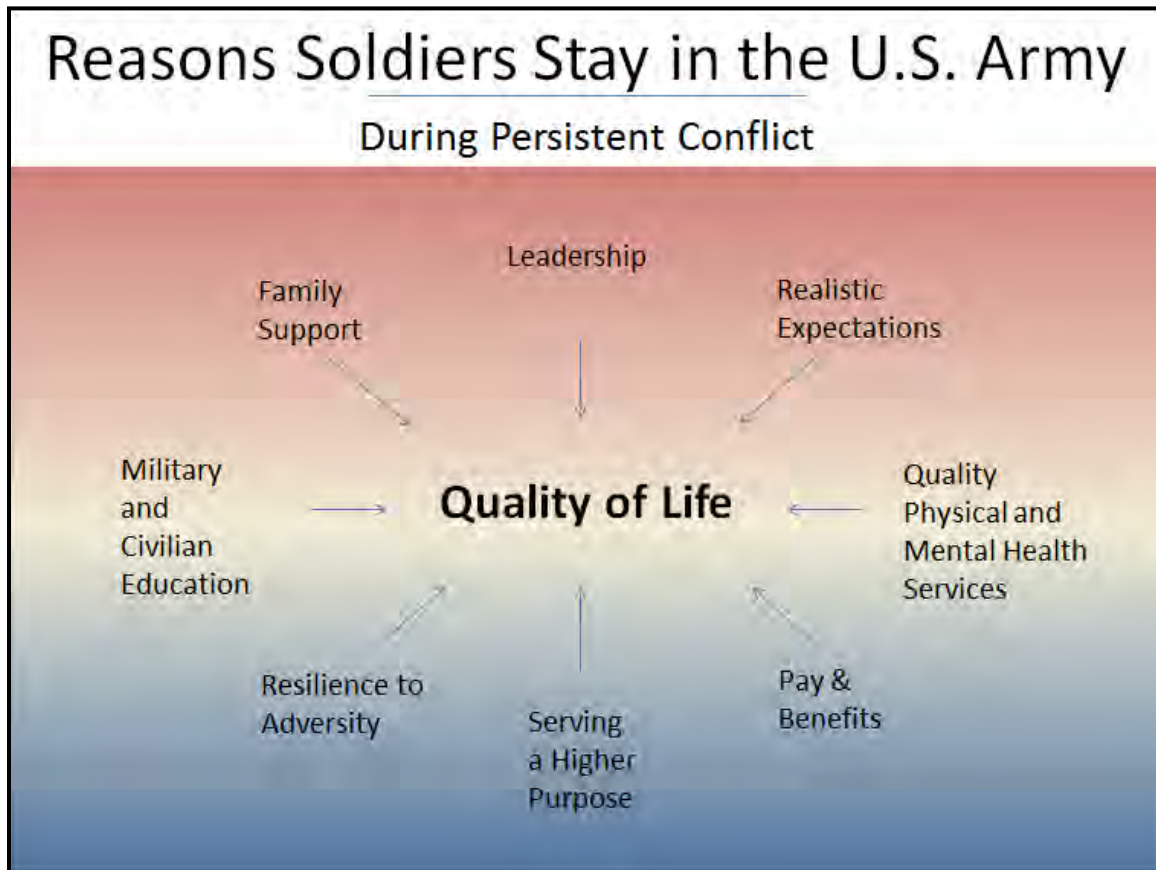
Figure 2 -- Subjective comparative analysis shows eight primary factors have influenced U.S. Army soldiers to stay in the Army beyond their initial term of enlistment during the last fifteen years.

improves soldier efficacy, builds stronger units, and encourages personal development. 25 Efficacy